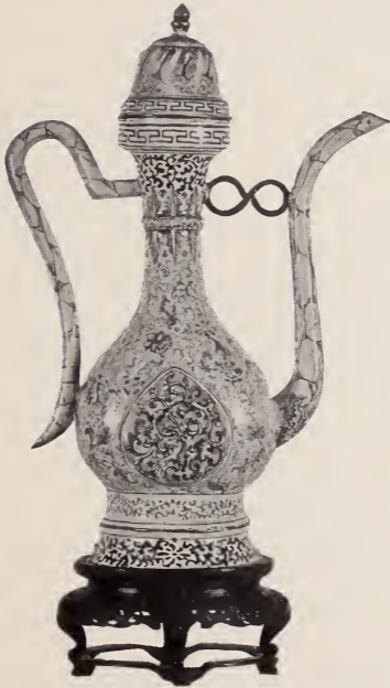
TALL ENAMELLED TEA POT